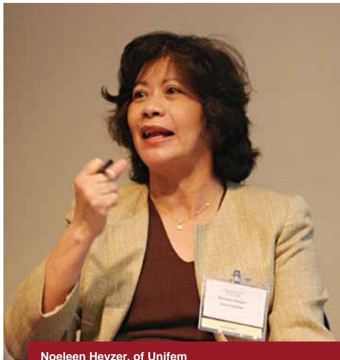
Noeleen Heyzer, of Unifem

But she believes that the biggest victory of the rise in women speaking out in Morocco has not been facing up to the extremist opposition that took against them for “touting anti-Islamic views and a western agenda” but that when women got some power, they took over the le-