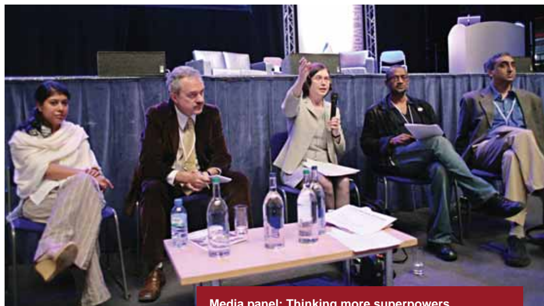
Media panel: Thinking more superpowers

He said that to succeed, alternative or as he put it ‘different’ media need to work together to help promote civil society causes